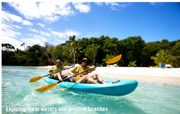
Enjoying clear waters and pristine beaches