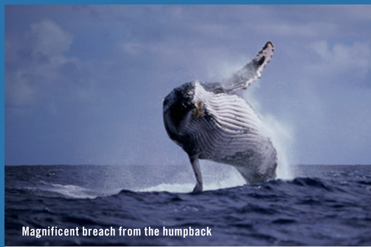
Magnificent breach from the humpback