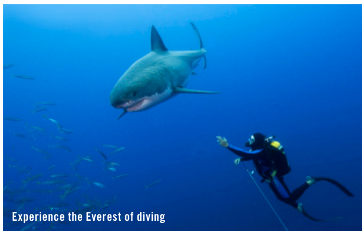
Experience the Everest of diving