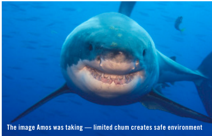
The image Amos was taking — limited chum creates safe environment