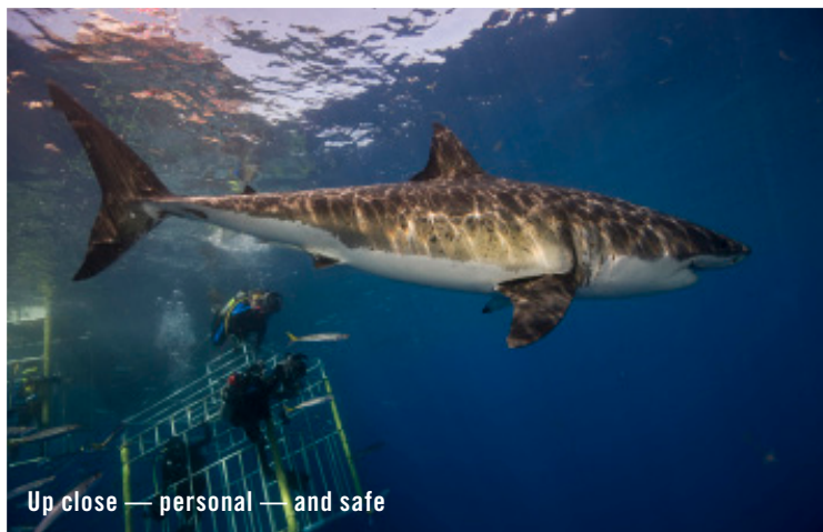
Up close — personal — and safe